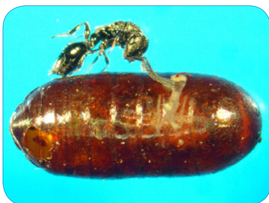
Figure 4. Spalangia endius wasp on a house fly pupa

Eight species of wasps that parasitise a range of flies have been identified on Australian feedlots. Species of Spalangia are dominant; typically 70–90% of wasps belong to these species. These very small wasps (2–3 mm long) lay their eggs only in the pupal stage of nuisance flies (Figure 4). The female wasp drills a hole in the pupal case and either feeds on the contents or lays a single egg. A wasp larva hatches from the egg and feeds on the fly pupa, eventually killing it. After approximately three weeks, the adult wasp emerges through a small hole in the pupal case. These parasitic wasps attack the pupae of a number of feedlot flies and ignore other insects. Because of their small size the adult wasps are seldom noticed. They are harmless to people and livestock.