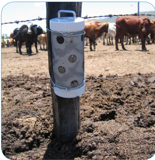
Figure 7. Release container for parasitic wasps

Parasitised pupae can be placed in release stations or in protected areas on, or near, the ground. Release stations protect the pupae from heat, direct sunlight and predators such as birds and ants. A simple release station is shown in Figure 7. It was constructed from PVC pipe (diameter 100 mm, 250–400 mm long) with multiple (10–20) round openings (diameter 25–35 mm) covered with fly mesh to prevent pupae from falling out but to allow wasps to leave the container. Use wire or ties to attach these stations to fence posts or rails located close to fly breeding areas (e.g. 200–500 mm above ground) and preferably out of reach of inquisitive animals (e.g. behind watering troughs). Bugs for Bugs also provides release stations suitable for wasps.