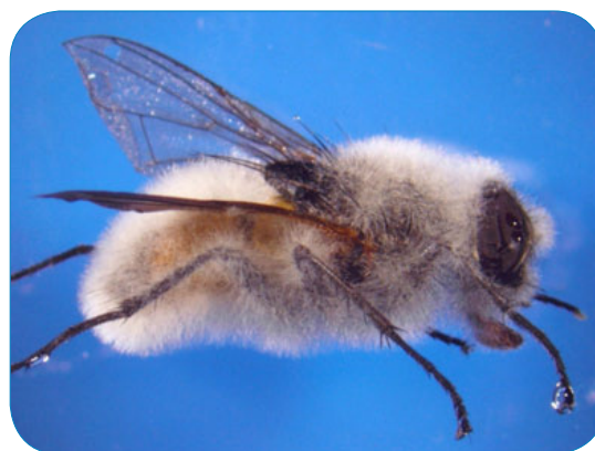
Figure 5. House fly infected with M. anisopliae

A number of microbial pathogens cause diseases that kill flies. The fungi Metarhizium anisopliae and Beauveria bassiana , isolated from house flies collected on Australian feedlots, show promise as biocontrol agents (Figure 5). Fungi are unique among the microbial insect pathogens in that they primarily infect their hosts through the outer exoskeleton (cuticle). Fungal spores are picked up on and stick to the insect's cuticle. Fungal spores applied to the environment of the target pest can be taken up through direct impact with the insect or indirectly when the insect is feeding or resting.